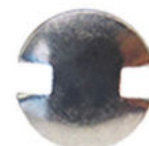
H type anti theft