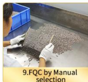
9. FQC by Manual selection