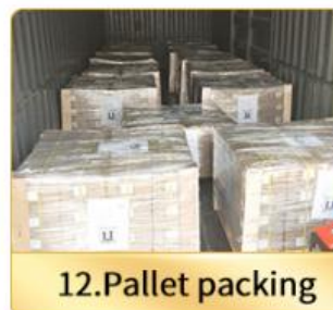
12. Pallet packing