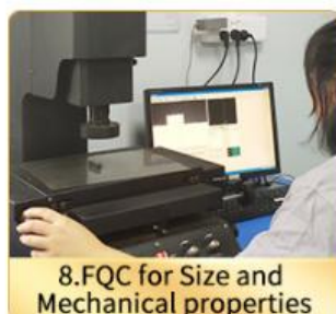
8. FQC for Size and Mechanical properties