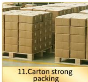
11. Carton strong packing