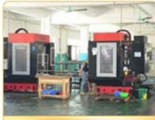
CNC Machining Center