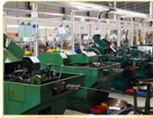
Multi-functional cold molding machine