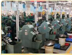
Screw threading machine