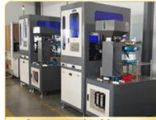
Screw optical image screening machine