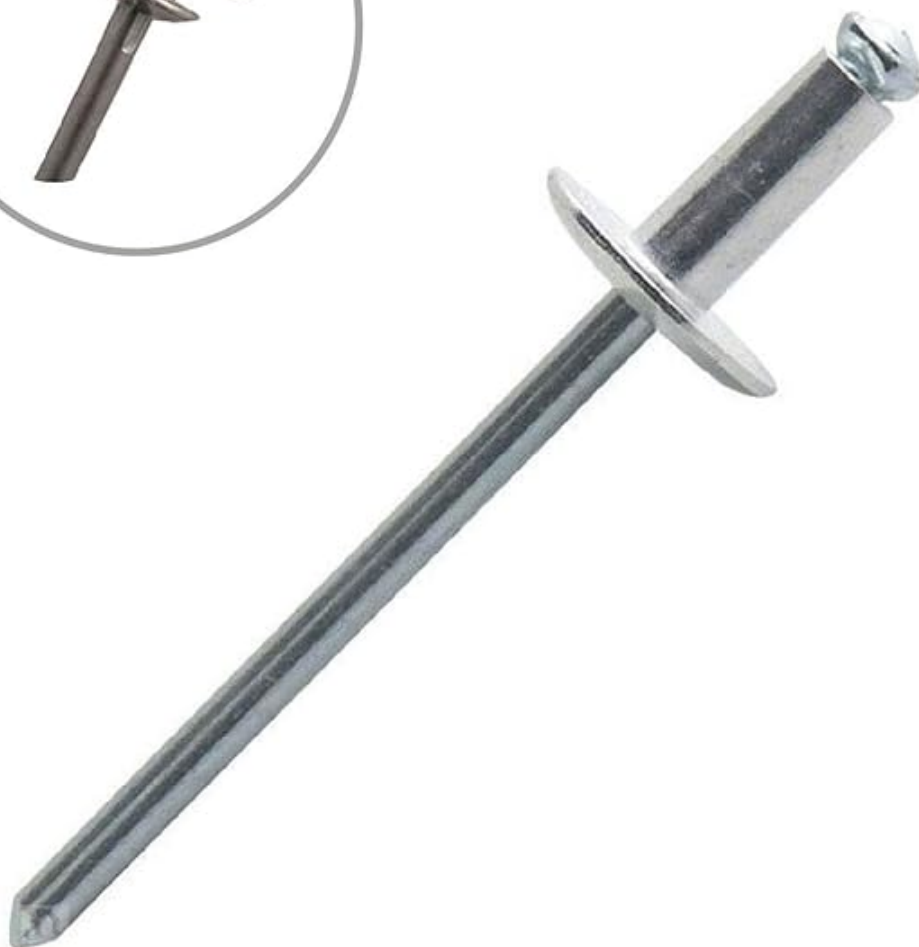
SCREW HEAD STYLES (頭型對照表)