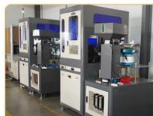
Screw optical image screening machine