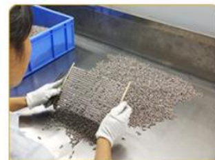
9.FQC by Manual selection