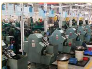
Screw threading machine