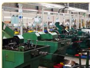
Multi-functional cold molding machine