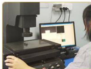
8.FQC for Size and Mechanical properties