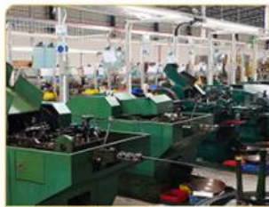
Multi-functional cold molding machine