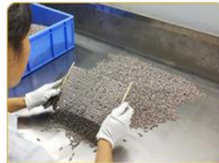
9.FQC by Manual selection