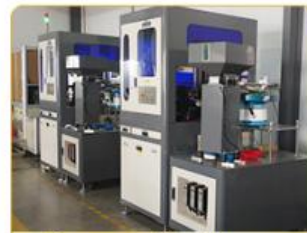
Screw optical image screening machine