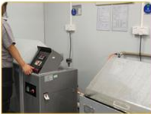
7.Salt spray test