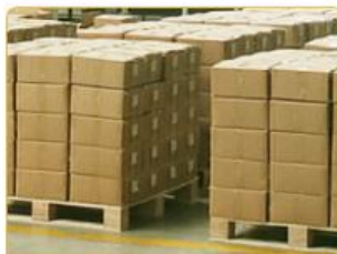
11.Carton strong packing