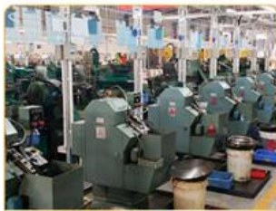
Screw threading machine