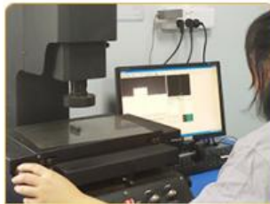
8.FQC for Size and Mechanical properties