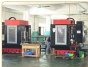
CNC Machining Center