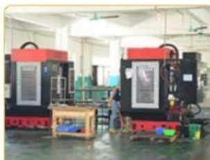
CNC Machining Center