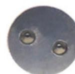
Two-Hole Tamper proof