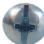
Phillips Slot Combination