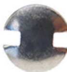
H type anti theft