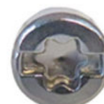
Slot 6 Lobe Combination