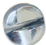
One way anti theft