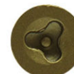
Tri-wing internal Tamper proof pin