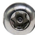
Torx-internal Tamper proof pin