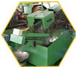
Screw Threading Machine