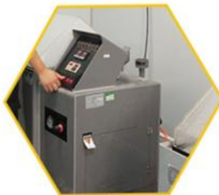
Salt Spray Tester