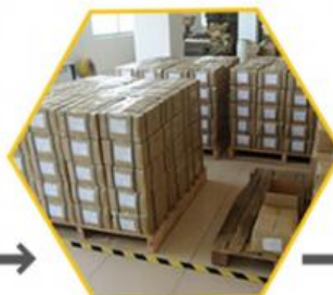
11.Carton Strong packing