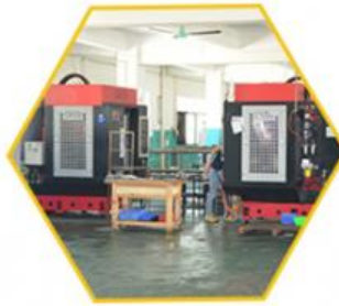
CNC Machining Center