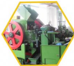
Multi-Functional Cold Molding Machine