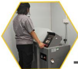
7.Salt spray test