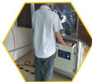
Screw Optical Image Screening Machine