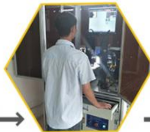
8.FQC for Size and Mechanical properties