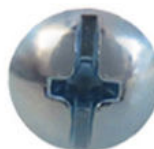
Phillips Slot Combination