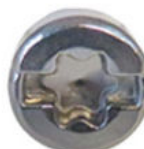
Slot 6 Lobe Combination