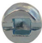
Square Slot Combination