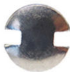
H type anti theft