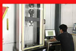
Tensile Force Test