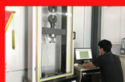
Tensile Force Test