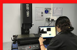
Image Measuring Instrument