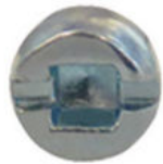
Square Slot Combination