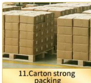
11.Carton strong packing