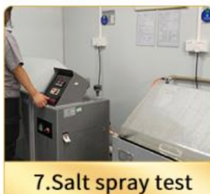
7.Salt spray test