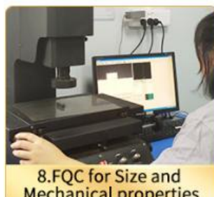
8.FQC for Size and Mechanical properties