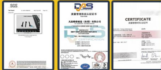
SGS Roduct Report

Quality report our products have been tested by ISO9001 IATF16949 SGS