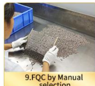
9.FQC by Manual selection