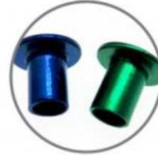
Green & Blue