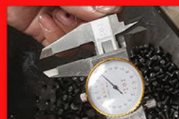
Thread Size (IPQC)