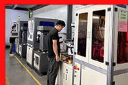
Screw Optical Screener