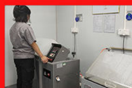
Salt Spray Test