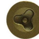
Tri-wing internal Tamper proof pin