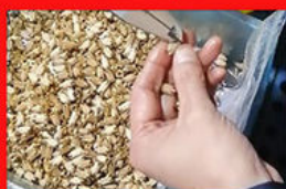
Spot check on surface treatment