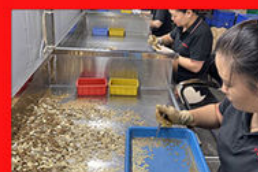
FQC by Manual Selection