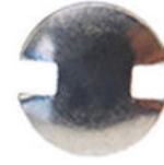
H type anti theft