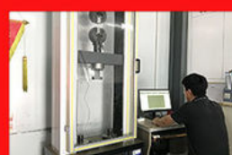
Tensile Force Test