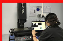
Image Measuring Instrument