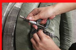
Raw Material (IQC)