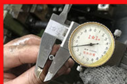
Head Size (IPQC)