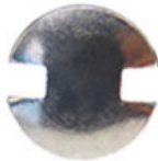
H type anti theft