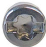
Slot 6 Lobe Combination