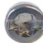
Slot 6 Lobe Combination