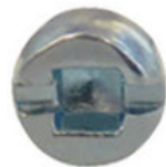
Square Slot Combination