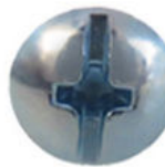
Phillips Slot Combination