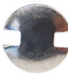
H type anti theft