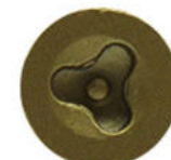
Tri-wing internal Tamper proof pin